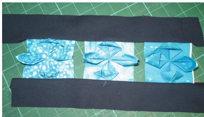
Add strips of desired width to edges of flowers. Use ¼" seam and be careful not to catch folded flowers bits. Pinning helps.