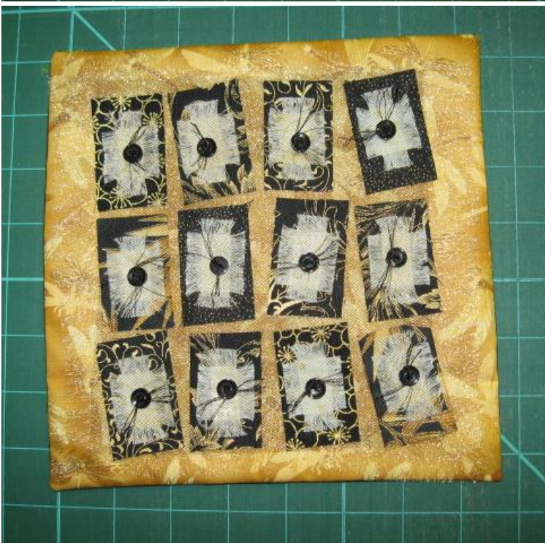
Finished block by Shirley Feldman

Finished Block 8\frac{1}{2} " x 8\frac{1}{2} "