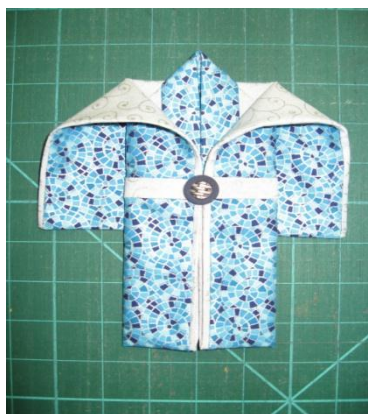
Step 11 – Flip flap back to form arms, add decorative button