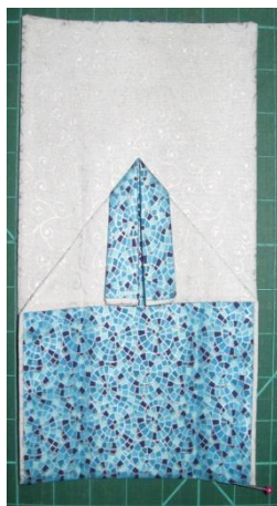
Step 9 – 4” fold below collar. Step 10a – turn corners down