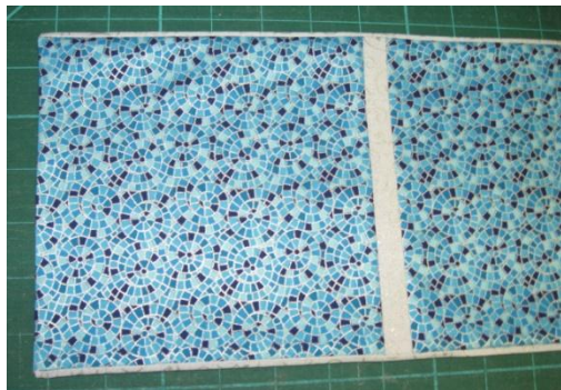
Step 2 – Note Accent joining strip and 1/8” accent on long edges