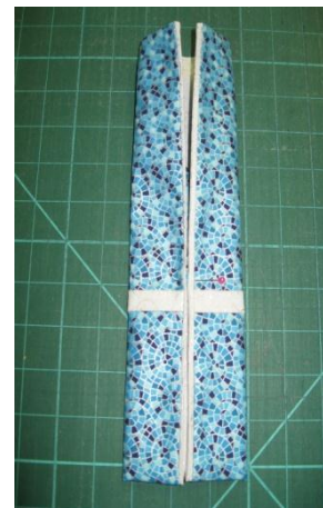
Step 10b – turn sides into middle, press to just above sash