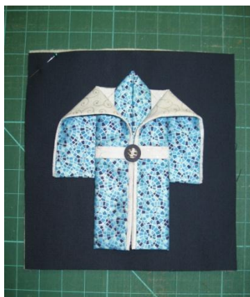
Position Kimono on 8 ½” square, tack top of collar to secure