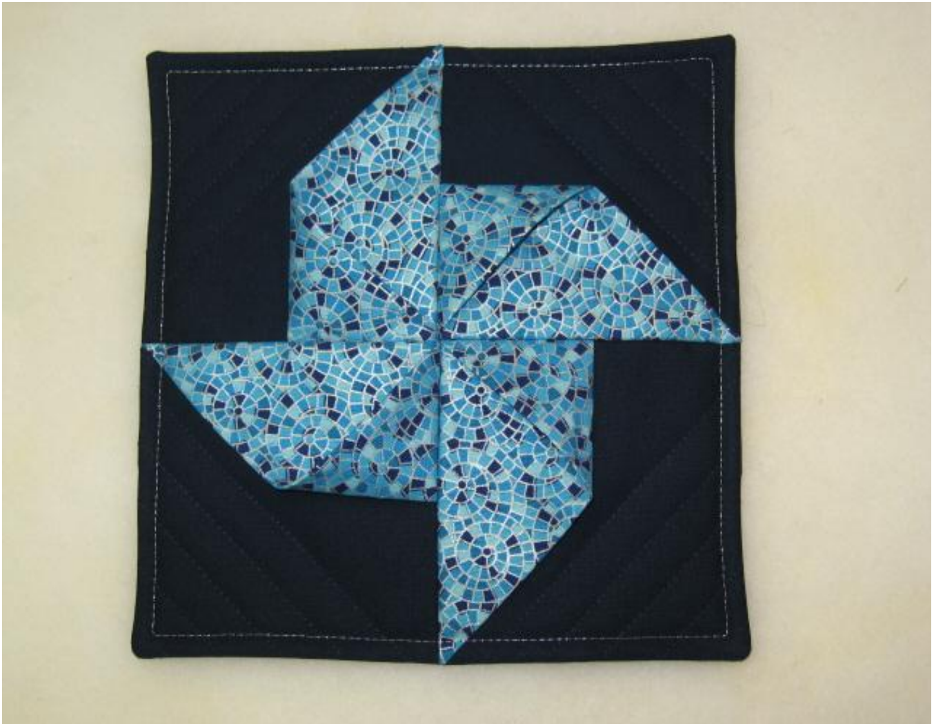
Finished Block 8\frac{1}{2} " x 8\frac{1}{2} "

Original concept from Christie Davidson 2011