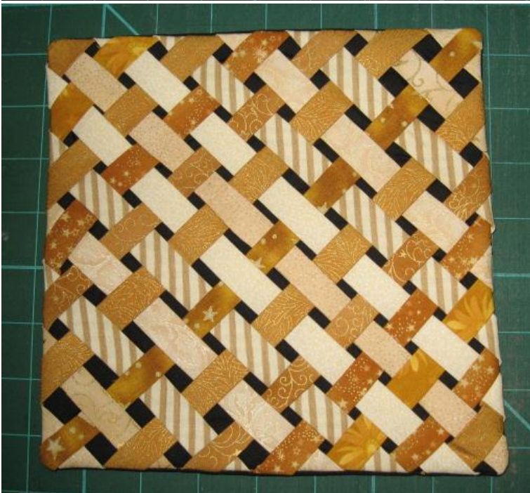
Finished block by Shirley Feldman