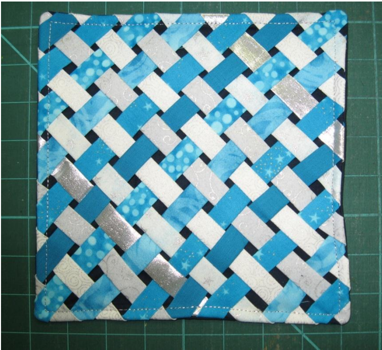
Finished block by SK Baldry

★ Cut 2 – 6 ½ x 8 ½ pieces of dark fabric for backing. Press ½ " over on one long edge of each piece. Fold again and press to create a finished hem, stitch. Centre the 2 pieces on top of the block, the pieces will overlap like a slip cover for a cushion. Pin on the sides. Trim the top and bottom fabric on block to even it out with backing. Pin top and bottom to secure overlap. Stitch ¼" seam all the way around. Trim corners to reduce bulk. Turn block right side out. Poke corners square with a corner tool or poking tool. Press block to ensure edges are crisp and line up. Topstitch ¼' from edge with desired thread.